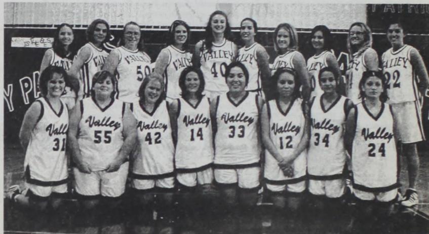
Valley Patriots Varsity & J.V. Girls 2001-2002