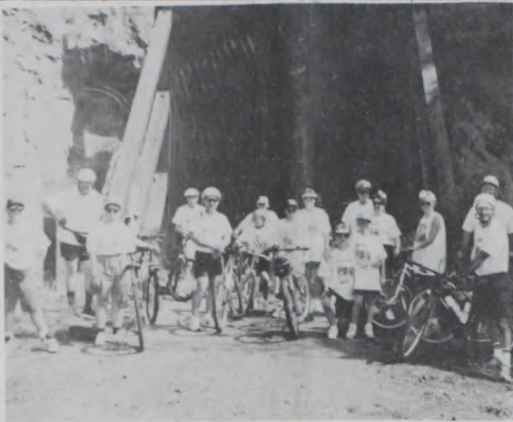
Seventeen enthusiastic cyclists took part in the September 10 Rails-to-Trails Bike ride that goes through the historic old railroad tunnel near Quitaque—the longest remaining tunnel in the state of Texas.

A memorial service will be held at 9 a.m. on October 2nd with the business meeting beginning at 9:30 a.m. and luncheon at 12 noon.