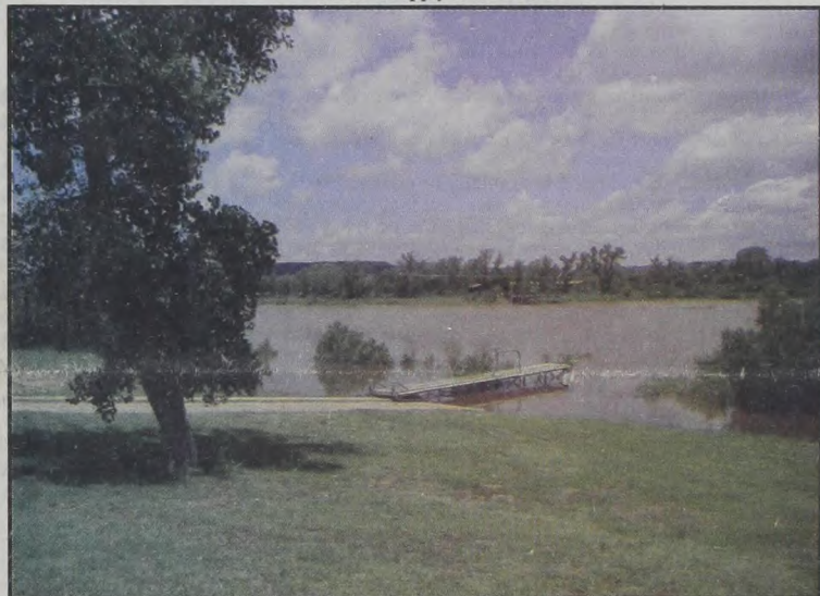
Lake Theo at Caprock Canyons State Park has received 11.8 inches of rain during the month of June and is up approximately 16 feet. It is sure to be a great place to cool off with some fishing or swimming this summer, so come on out!