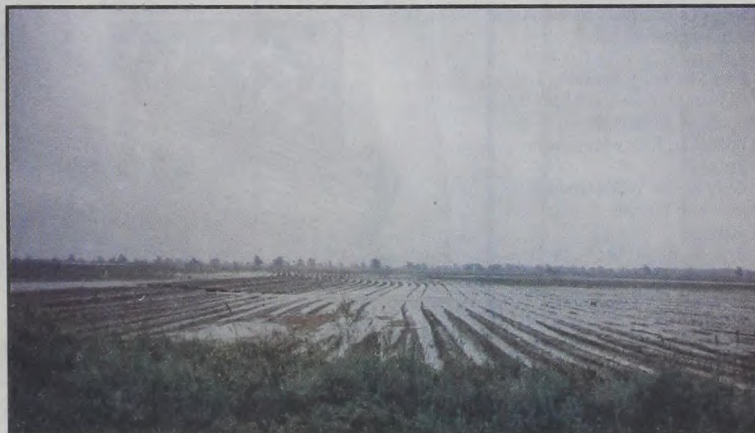
Locally heavy rains have pounded the Valley area over the past two weeks and has left some farmers trying to decide if they need to add outboard motors to their tractors.

Fireworks begin at dark, just west of the City Park. Everyone is invited to come out, bring your lawnchairs and enjoy the festivities with your friends and neighbors as Turkey celebrates our nation's birthday.