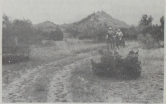
Beautiful Caprock Scenery Is Backdrop for Memorial Trail Ride

Quitaque, Texas. West noted that this type of system is ideal for rural environments such as Quitaque, where there is not a large concentration of customers in any one spot.