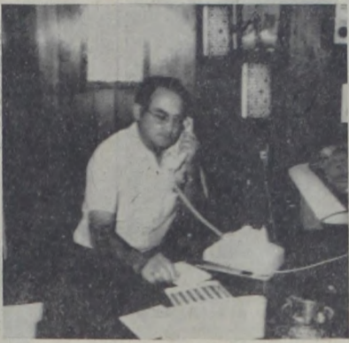
calls in their respective communities over the new DDD, or Direct Distance Dialing, system. Both towns have new seven-digit dialing systems, and on Wednesday night