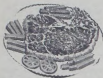
"Finest Steak South of KC"