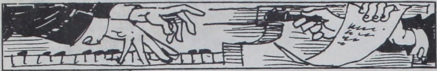
The great musician Ignace Jan Paderewski became the first premier of the Republic of Poland after World War I.