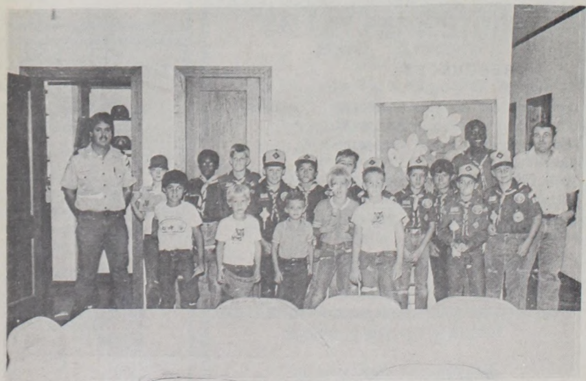
Tiger Cubs and Leaders at Graduation