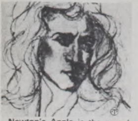
Newton's Apple is the award-winning PBS science series. It can help you get your thoughts in motion.

Additional information about applying for Social Security retirement benefits can be obtained at the Social Security office at 1401-B West 5th Street, or you may call us at 293-9623. Appointments can be arranged if desired.