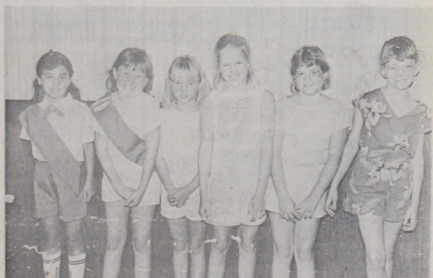
One local Brownie Troop at workshop

Also discussed was the resolution to ask W.T.U. to (cont. on page 2)