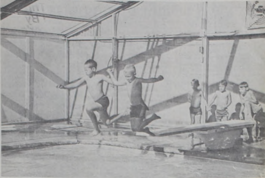
Kids having fun at swimming lessons in Turkey