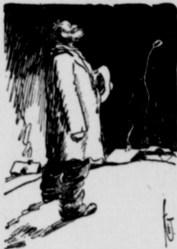
Peter stood alone for a long time watching the star appear.

Peter remembered: How he had come home late that evening; how the earth began quivering like a beast possessed; how he had