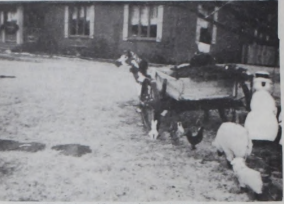
J.T. Rogers residence - Second Place home

CHERRY S'MORES Prep time: 3 min. Microwave time: 4 min.