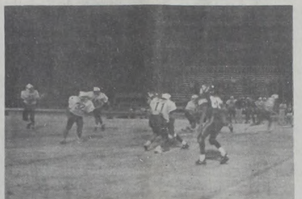
Valley in action against Vernon Northside