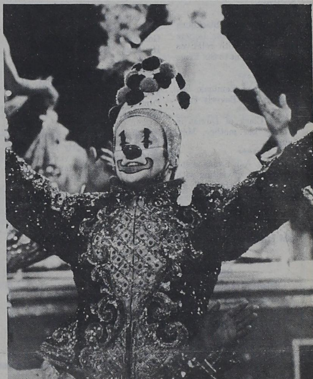
SEQUINED HARLEQUIN—Happiness is the 106th Edition of Ringling Bros. and Barnum & Bailey Circus, celebrating "200 Years of Circus in America."

Almost all tornado activity in the United States occurs east of the Rocky Mountains. Although tornadoes have been recorded in every month, the peak season varies with location. Generally April through July represents the peak season.