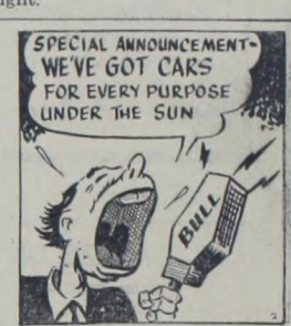
Simpson Chevrolet Co.

doubt your grandmother—" Office Boy:" How did you guess, sir? She's makin her first solo