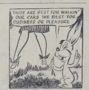
Simpson Chevrolet Co.

Refreshments of iced tea, choco-late and plain cake squares, and a vegetable fruit salad were served