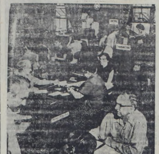
COMMUNICATIONS will be the lifeline of Operation Alert, 1956, just as they are of any effective nationwide defense against "at-