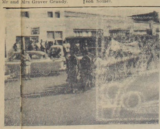
Float of the Silverton Girl Scouts