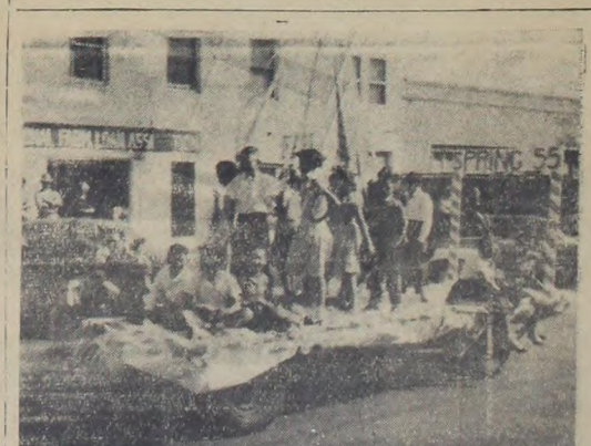
5th Grade Float featuring a Maypole