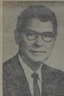
ORVILLE L. FREEMAN Secretary of Agriculture

Secretary of Agriculture Orville L. Freeman will visit Lubbock Monday, November 4, to learn first hand what farmers and ranchers across the nation are thinking and saying.