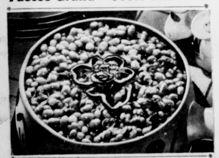
Are you finding it hard to balance your food budget? Here's a taste-tempting bean dish that's certain to please your folks and ease

For beans at their best, buy Ann Page Beans . . . sold only at your A&P. They're plump and tender . . drenched in delicious tomato or molasses sauce . . all ready to heat and eat. Serve as is or try . . . BEANS MEXICANA: Sauté ½ lb. ground beef with 2 medium onions and 1 green pepper, chopped. Add 2-1 lb. cans Ann Page Beans (any style), 1 can cream style corn, 1 tsp. Ann Page Chili Powder, 1 tsp. salt, ¼ tsp. pepper, heat and serve, Or turn into casserole; top with pepper rings; bake in hot oven (400° F.) 20 min. Serves 6.