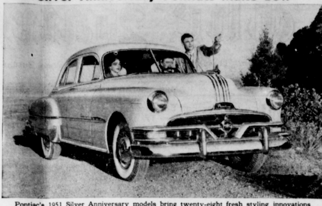
Pontiac's 1951 Silver Anniversary models bring twenty-eight fresh styling innovations and seventeen mechanical improvements to the line. The new Pontiacs, now on display, again are available with six or eight cylinder engines. All models offer a choice of Hydra-Matic or synchro-mesh transmission. The popular Chieftain four-door sedan pictured exemplifies the advanced styling of the Pontiac Line.