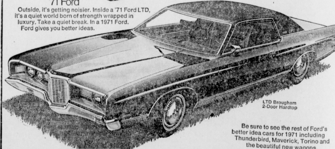
LTD Brougham 2-Door Hardtop

Outside, it's getting noisier. Inside a '71 Ford LTD, it's a quiet world born of strength wrapped in luxury. Take a quiet break. In a 1971 Ford. Ford gives you better ideas.