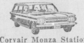
Corvaire Monza Station Wagon. Monza elegance in a nimble hauler.