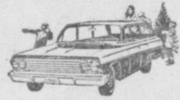
Biscayne 6-Passenger Station Wagon. Lowest priced Jet-smooth wagon.