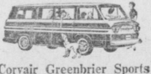
Corvaire Greenbrier Sports Wagon. Sure-footed traction and easy to load.

Want a wagon? Chevrolet's got a dozen dandies. Five Jet-smooth king-sized jobs, for instance. Three frisky Chevy II wagons—with lots of luxury, load space and a low, low price. Plus four rear engine Corvaire wagons like no other in the land. Find the one for you in this versatile variety at your Chevrolet dealer's.