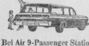
Bel Air 9-Passenger Station Wagon. Has an almost 5-ft.-wide cargo opening.