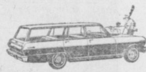
Chevy II 300 3-Seat Station Wagon. Lowest priced U.S. 3-seat station wagon.