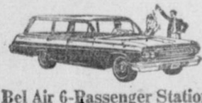
Bel Air 6-Passenger Station Wagon. Roomy hauler with a rich appearance.