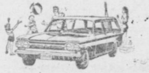
Corvaire 700 Station Wagon. Extra load space in that trunk up front.