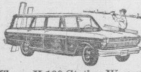
Chevy II 100 Station Wagon. Lowest priced wagon in Chevrolet's lineup.