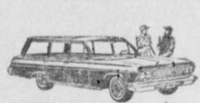
Impala 9-Passenger Station Wagon. Most elegant Chevrolet wagon.