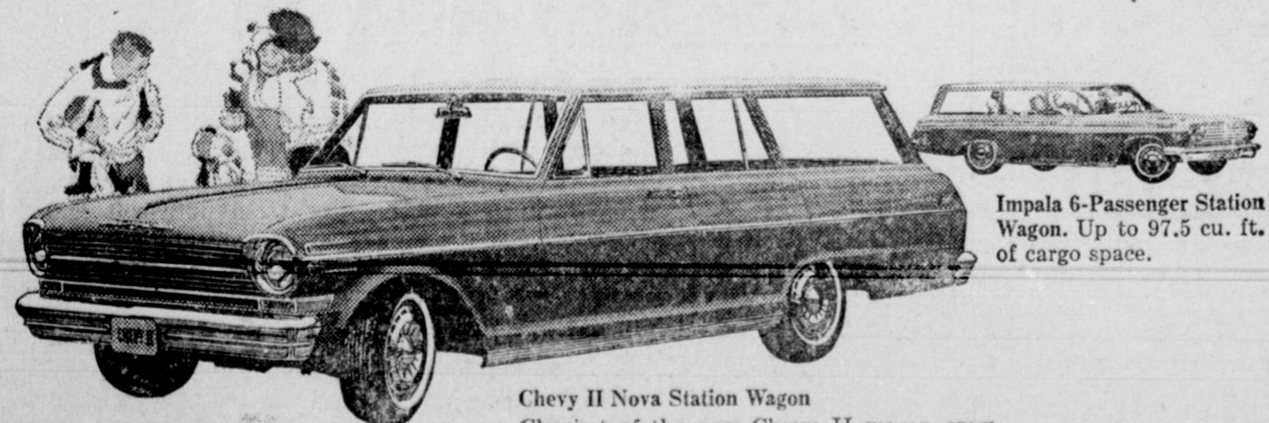
Chevy II Nova Station Wagon. Classiest of the new Chevy II wagon crew with rich appointments and a spunky six.

Chevrolet's got WAGONS by the dozen! ...in a beautiful variety of styles, sizes and prices