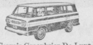
Corvaire Greenbrier De Luxe Sports Wagon. Over 175 cubic feet for cargo.