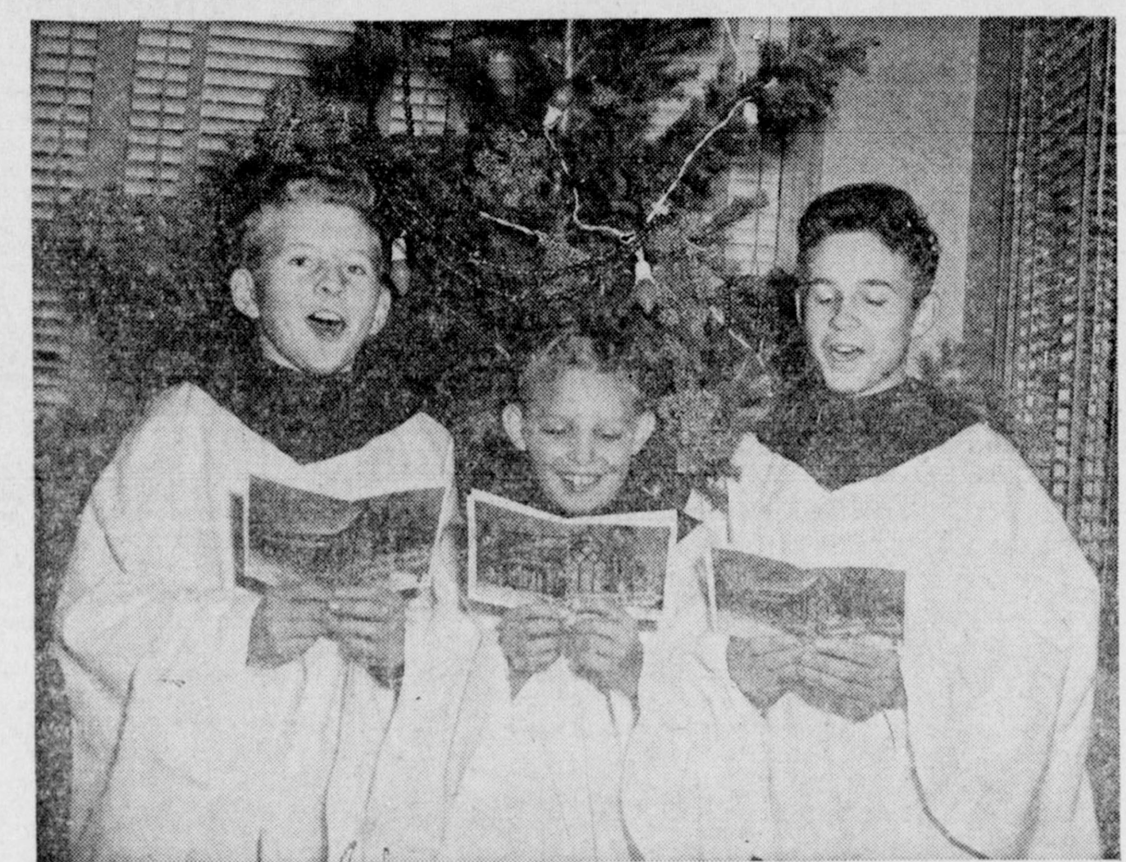
Children of the Methodist Home in Waco, Texas, sing hearty wishes of a Merry Christmas and a Happy New Year to their friends across the Southwest. The Methodist Home serves in providing a home-like atmosphere for children separated from their families by death, poverty and other misfortunes. Over 400 youngsters receive individual care in family sized groups at the Home which will soon celebrate its 72nd anniversary.