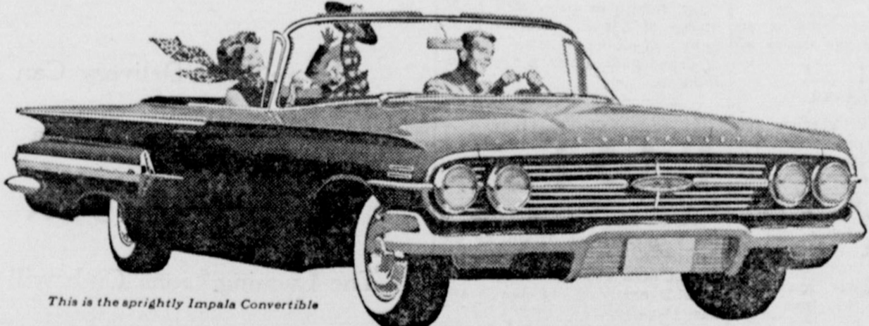
This is the sprightly Impala Convertible

You couldn't pick a better time to buy your new Chevrolet (or Corvaire) than right now when more people are buying them than ever before. Chances are good you're going to like what Chevy's got just as much as everybody else. (Especially the money you'll save.) Check your dealer on the details while there's still a wide choice of models.