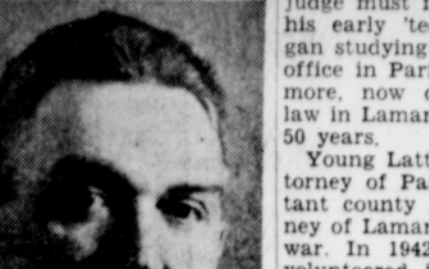
run-off candidate for Judge of le Court of Criminal Appeals.