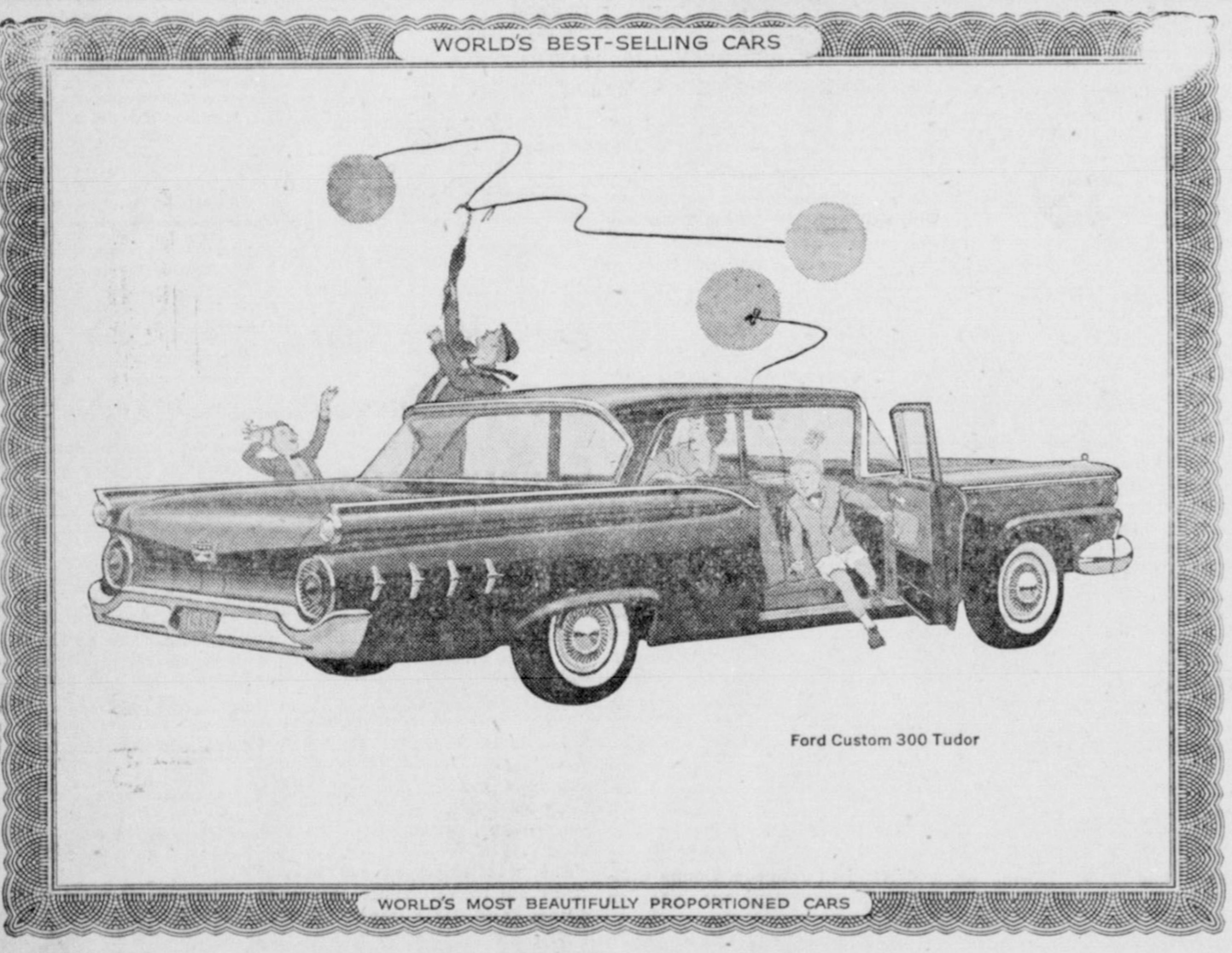
Ford Custom 300 Tudor

WORLD'S BEST-SELLING CARS Your bigger-than-ever savings start here... during DIVIDEND DAYS at your Ford Dealer's