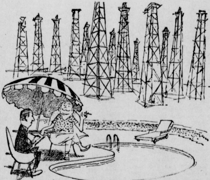
"It all began with a savings account at"