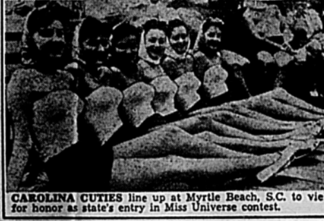
CAROLINA CUTIES line up at Myrtle Beach, S.C. to vie for honor as state's entry in Miss Universe contest.