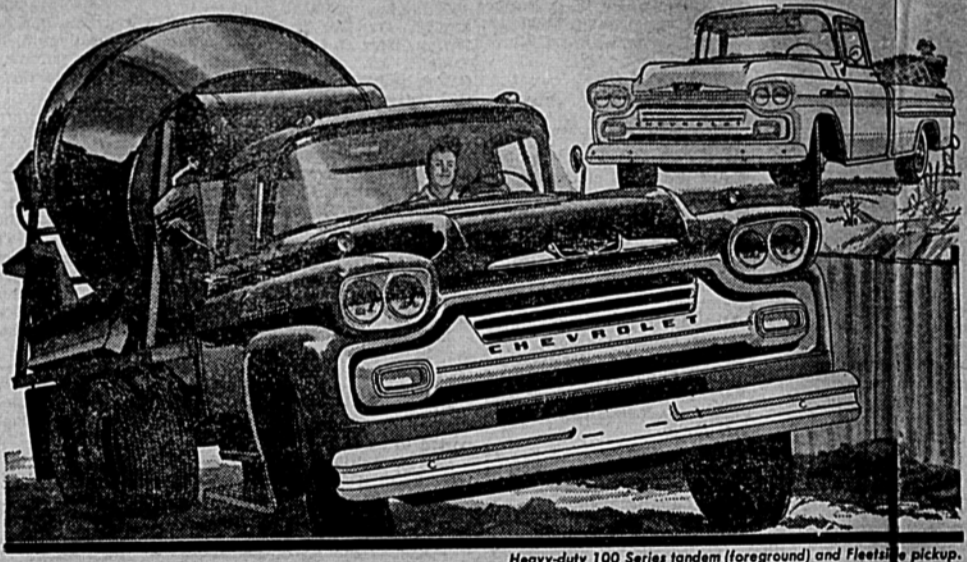
Heavy-duty 100 Series tandem (foreground) and Fleetline pickup.

You get the right power... right down the line!