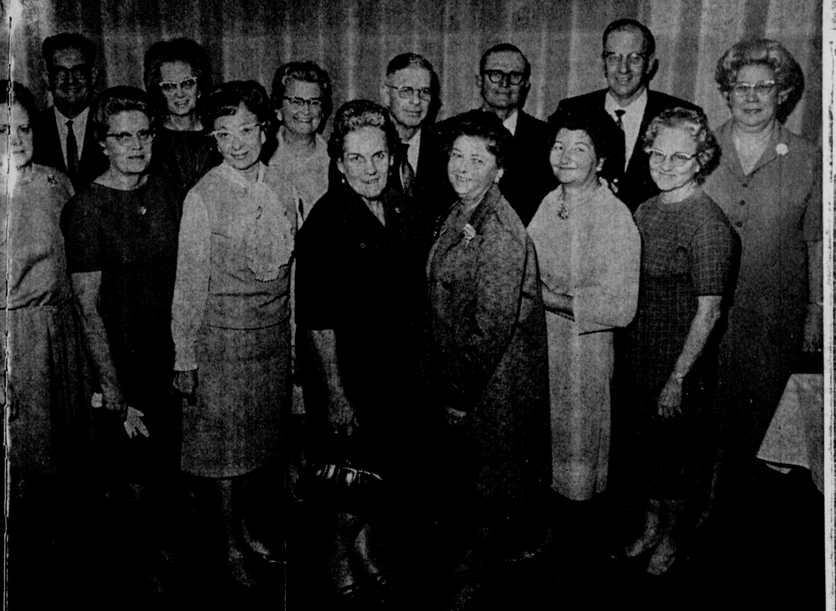
15 Members of '28 Class Meet and Eat