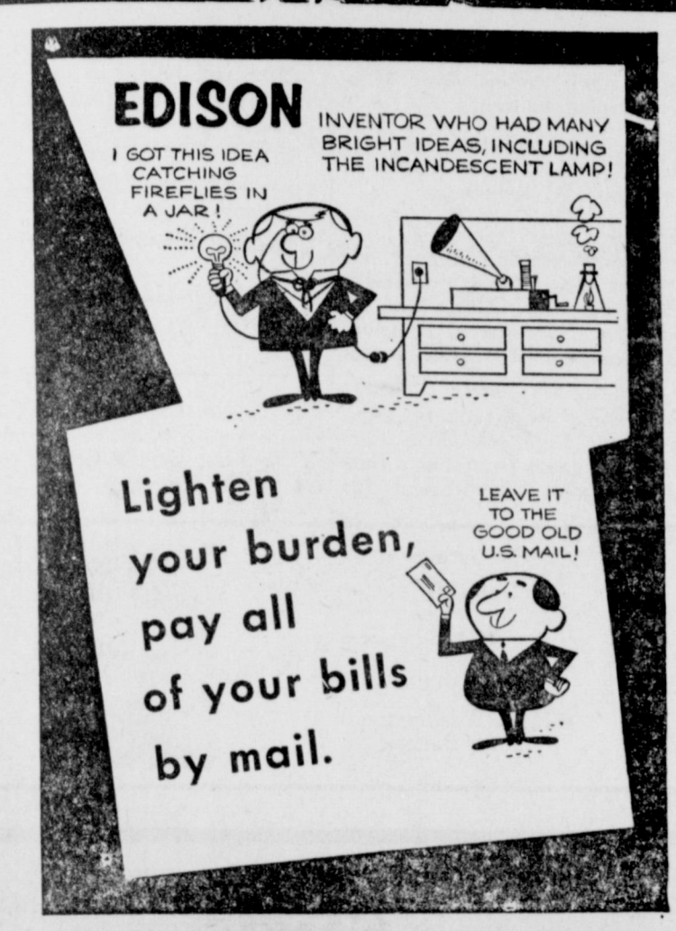
Member Federal Deposit Insurance Corp.