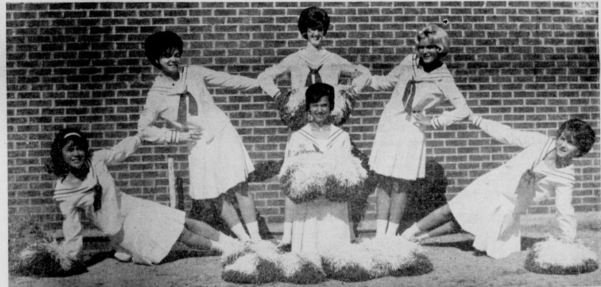
Iowa Park Cheerleaders

Go with the Hawks to Coyote Stadium this Friday for the Henrietta Game.