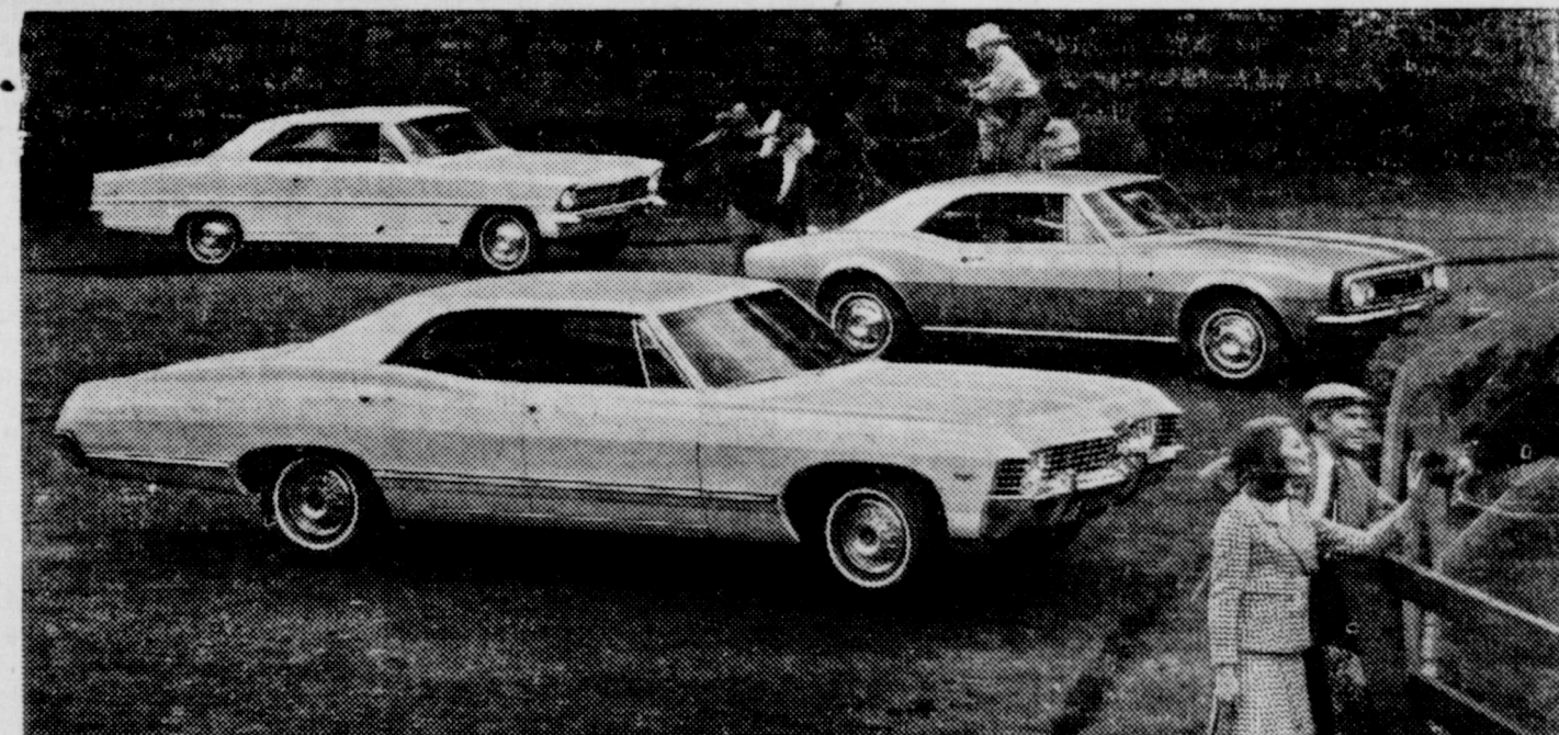
Top left: Chevy II Nova Sport Coupe. Foreground: Chevrolet Impala Sport Sedan. Top right: Camaro Sport Coupe.