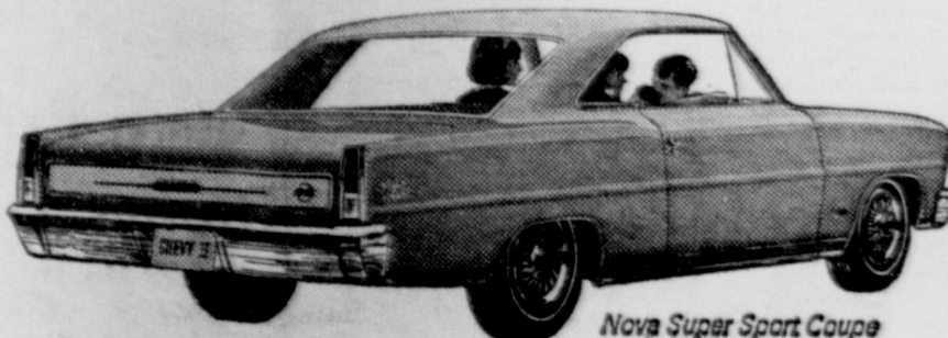
Nova Super Sport Coupe