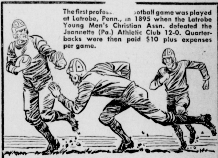
The first professional football game was played at Latrobe, Penn., in 1895 when the Latrobe Young Men's Christian Assn. defeated the Jeannette (Pa.) Athletic Club 12-0. Quarterbacks were then paid $10 plus expenses per game.