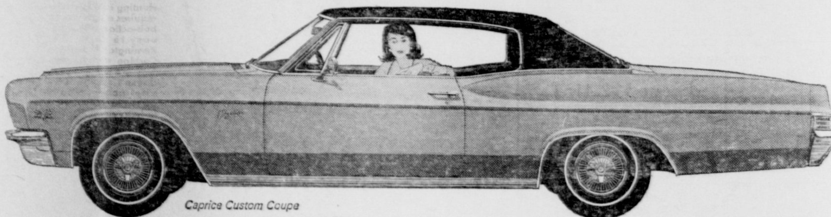
Caprice Custom Coupe