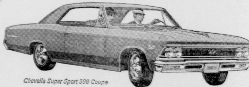
Chevelle Super Sport 396 Coupe

New 300's. New 300 Deluxe models. New Malibus. And two new Super Sport 396's—coupe and convertible—with engines that tell you exactly what kind of Chevilles they are. Both are available with 396-cu.-in. Turbo-Jet V8's, either 325 hp or 360 hp. And both come with special hood, grille, suspension, emblems, red stripe tires, floor-mounted shift. Twelve beautiful new Chevilles in all—and all as new inside as they are outside, headlamps to taillights.