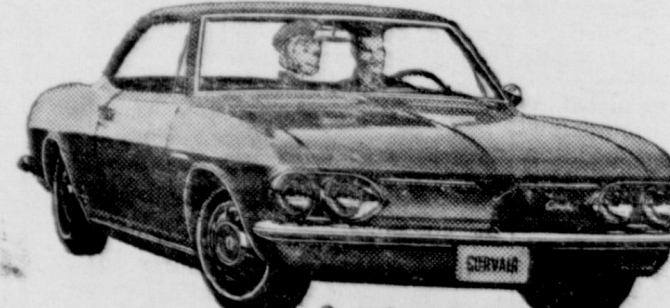
Corvair Sport Coupe