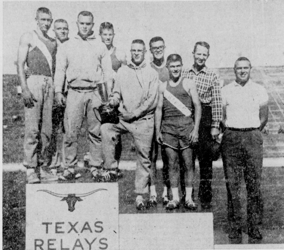
1961 Hawks were State Champions