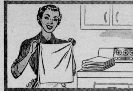
Many things come out of your dryer so fluffy-smooth, they need only folding before you put them away