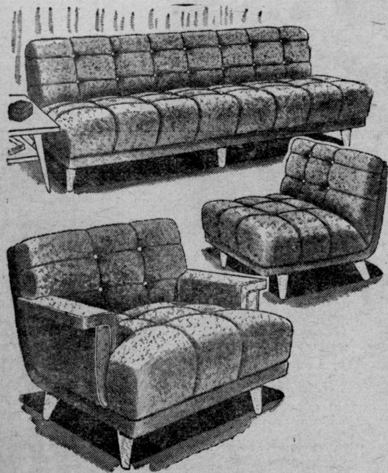
Photo not an exact illustration of merchandise advertised

COMPLETE SELECTION OF BEDROOM FURNITURE IN STOCK