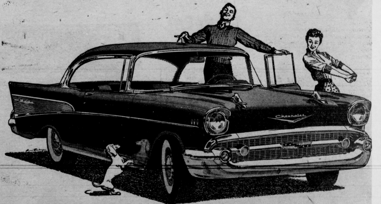
More beautifully built and shows it—the Bel Air Sport Coupe.