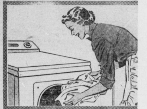
For others, you just set the controls for damp just right for easier ironing. No sprinkling ne

Gentle electric clothes drying shortens ironing time because electrically-dried clothes have fewer wrinkles and no clothespin "ears" to iron out. Many fabrics such as towels, corduroys and knit goods come from your Electric Dryer so wrinkle-free they require no ironing at all. And, of course, you free yourself from monotonous clothesline drudgery when you dry clothes electrically. Your time-saving, work-saving Electric Dryer is economical, too, because it protects clothes while it dries them.