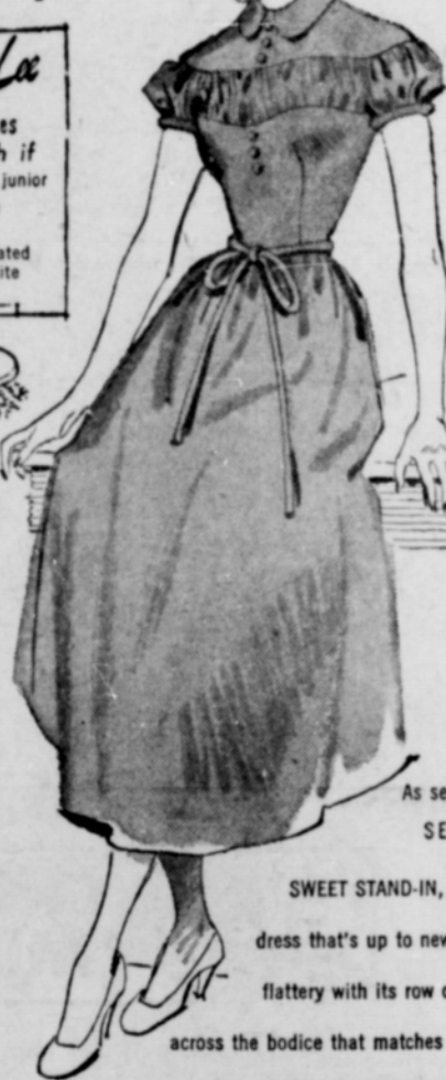
As seen in SEVENTEEN!

Shirley Lee junior petites are your dish if • you're a pint size junior • you're a teen with junior ideas • you like sophisticated styling for your petite figure