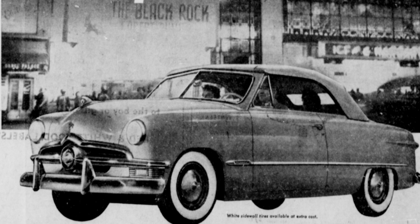
White sidewall tires available at extra cost.