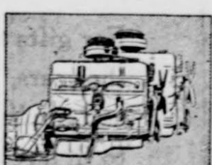
Thrifty new power in all models

Fine new upholstery fabrics with a more liberal use of beautiful, durable vinyl trim. New color treatments in harmony with the brilliant new exterior colors.