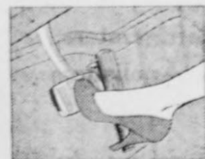
Power brakes for easier stops

with POWER BRAKES, AUTOMATIC WINDOW and SEAT CONTROLS