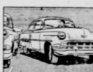
New, lower price on power steering

Chevrolet Power Steering now reduced in price! It does 80% of the work to give you easy, sure control. Optional at extra cost on all models.