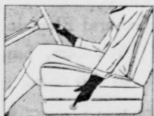
New, automatic window and seat controls

More things more people want, that's why MORE PEOPLE BUY CHEVROLETS THAN ANY OTHER CAR!