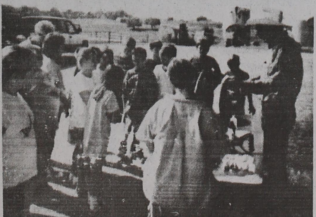
Fifth graders learn to appreciate area agriculture and natural resources on this field day.

Outstanding Citizen Award deadline for submitting nomination is Friday, September 10th.