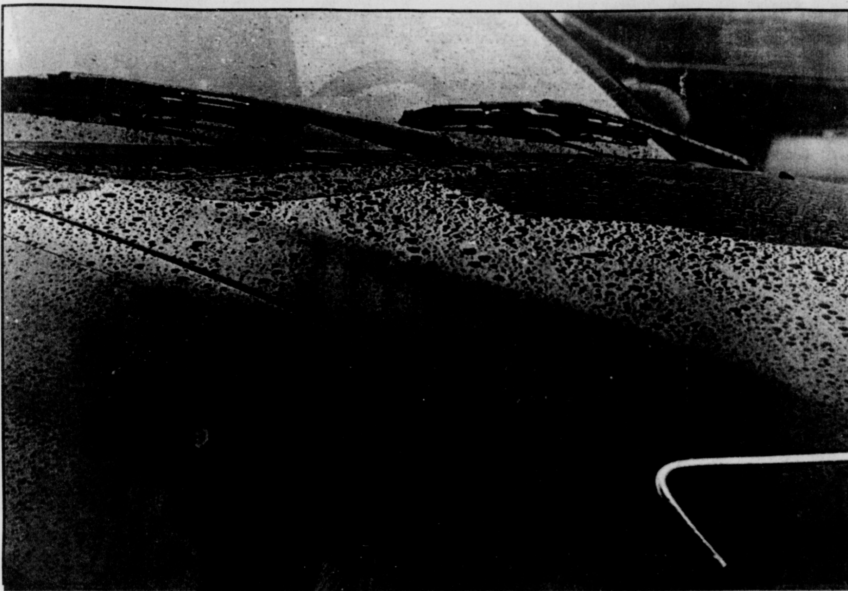
OBSERVATION OF A TEASE - Mother Nature teased Iowa Park residents Monday night and Tuesday morning, by producing only a trace of precipitation, shown collected on the