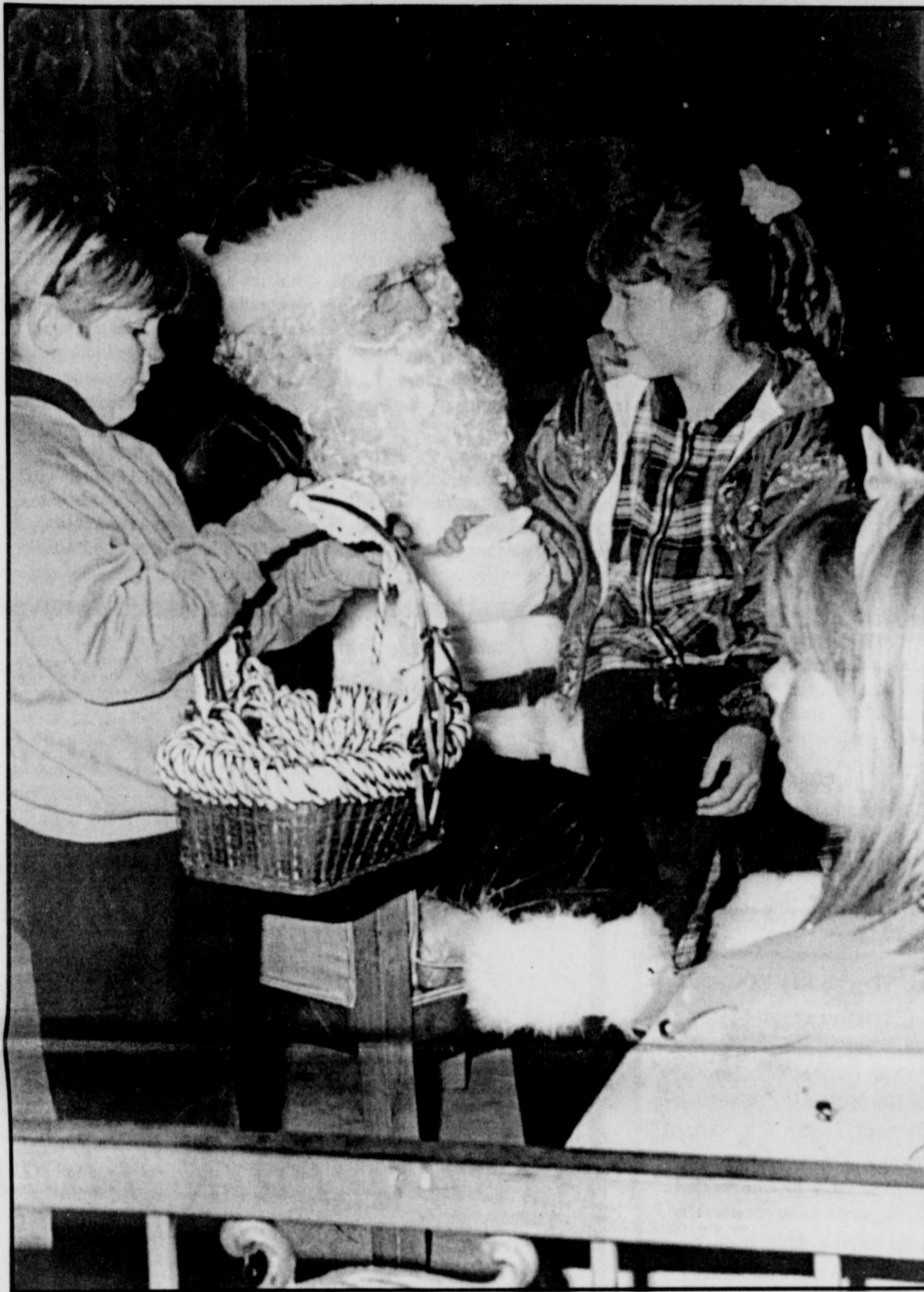
SANTA'S EARLY VISIT to Iowa Park was a highlight for more than 100 children. He made his appearance Thursday night, during the annual Christmas lighting ceremony, held at the Tom Burnett Memorial Library. Each child was afforded the opportunity to visit with him personally, explaining what they want for Christmas, and receiving a favor from elves.