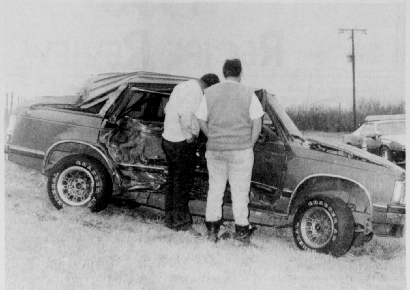
TWO-VEHICLE COLLISION Monday afternoon resulted in Pamela Moss, 35, being transported by ambulance to a Wichita Falls hospital. Moss, who's address is 4957 FM 258, was westbound on that highway when she was struck broadside at the FM 368 intersection by a pickup driven by Horace Kelly, 62, of Salado, who was southbound and failed to observe the stop sign.

Land for the building already has been provided, on a long-term lease basis, and is located on the north side of the Recreational Activities Center.