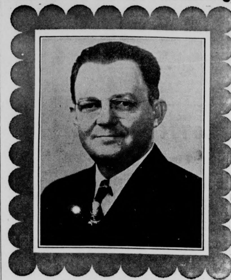
SENATOR DUDLEY J. LeBLANC

The continued increasing demand for HADACOL, one of the truly great medical discoveries given to the world by Senator Dudley J. LeBlanc, has made it necessary to decrease the ration allowance on HADACOL from six bottles to two bottles.