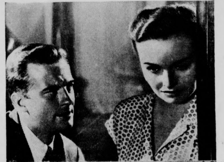
Torn between love and what she feels to be her duty, Jeanne Crain faces a tight emotional conflict when Bill Lundigan, with whom she is in love, visits her in her Southern cabin home. The scene occurs in "Pinky," which begins its run at the Parkway Theater next Tuesday. Cast in other starring roles are Ethel Barrymore and Ethel Waters.