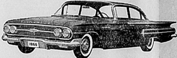
4 BEL AIRS--Priced just above Chevy's thriest models! Like all Chevies, they give you the famed Hi-Thrift 6 or a new Economy Turbo-Fire V8 as standard equipment. 4-door Bel Air sedan above.