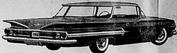
4 IMPALAS--All the car you ever yearned for! Each embodies distinctive treatment inside and out, with triple-unit rear lights, fingertip door releases and safety-reflector armrests. Impala sport sedan above.

Nearest to perfection a low-priced car ever came!