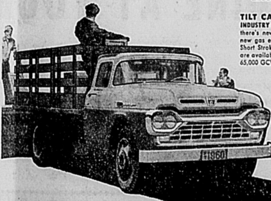
MEDIUM DUTY—LOWEST PRICED OF THE LEADING MAKES! In addition to lowest price, this F-600 Styleside offers increased strength in frame and sheet metal... colorful new cab interiors... the gas savings of Ford's modern Six, Maximum GVW, 21,000 lb.

*Name available on request. Send inquiry to P.O. Box 2687, Ford Division, Ford Motor Company, Detroit 21, Michigan