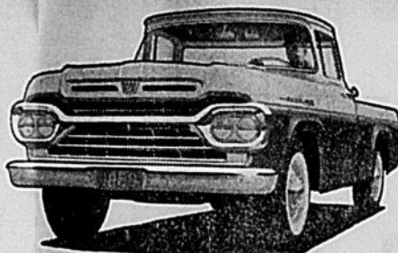
LIGHT DUTY—LOWEST PRICED OF THE LEADING MAKES! And look what the low price of this half-ton Styleside includes! New 23.6% more rigid frame, new longer-lasting brakes, new styling and comfort, new Diamond Lustre Finish!

They're here! LOWEST-PRICED LIGHT AND MEDIUM TRUCKS Priced lowest of the leading makes* NEW FORD TRUCKS for 60 with Certified Economy