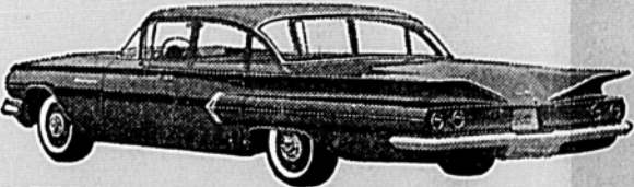
3 BISCAYNES--These (honest to gosh) are the lowest priced of the '60 Chevrolets. They bring you the same basic beauty and relaxing roominess as the other models. 4-door Biscayne sedan above.