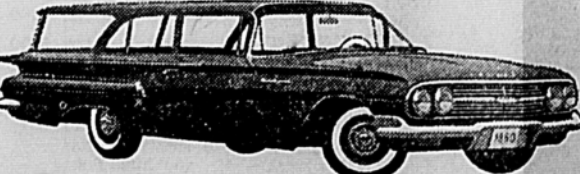
5 STATION WAGONS--Styled to carry you away, with the kind of cargo space to carry away most anything you want to take with you! Thrifty 2-door Brookwood above.

Top entertainment--The Dash Show Chevy Show--Sundays NBC-TV--Pat Boone Chevy Showroom--Weekly ABC-TV--Red Station Chevy Special Friday, October 9, CBS-TV.