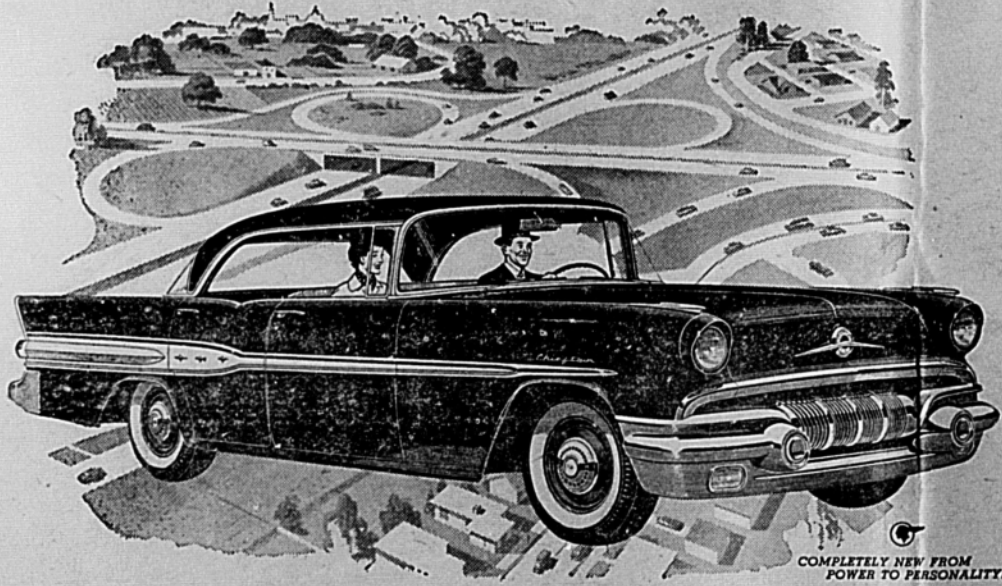
COMPLETELY NEW FROM POWER TO PERSONALITY!

Actually costs Less than a lot of the low-priced cars!