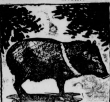
THE COLLARED PECCARY OF SOUTHERN UNITED STATES AND MEXICO HAS A MUSK POUCH, BUT IT HAS NO SIGN OF A TAIL.