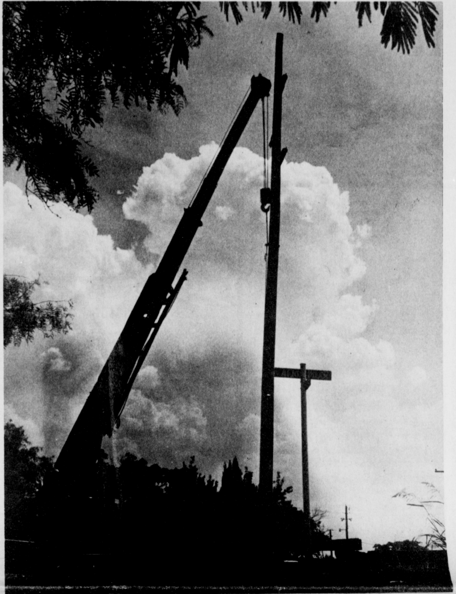
TOWERING POLES are being erected along West Magnolia which will allow Texas Electric Service Company to service Cryovac with 69,000 volts of electricity. The huge, 65-foot tall poles almost double the regular height poles throughout town. Line completion is expected this week, but it will not be energized until early August,

Judging this year's TPA better newspaper contest were members of the Georgia Press Association. Awards earned in the contest were presented at the 99th annual TPA summer convention held in Amarillo.