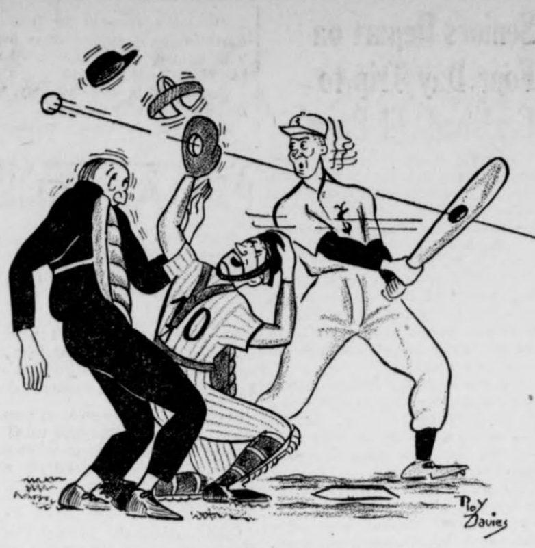
Our slow ball artist is showing off!