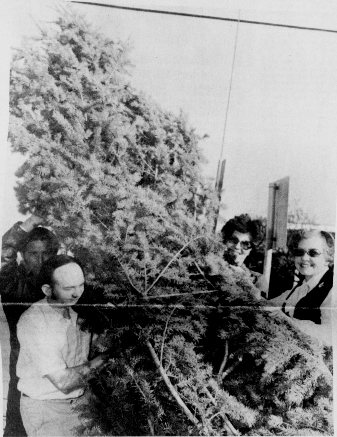
JUST IN TIME - Members of the Iowa Park Optimist Club and Chamber of Commerce raised the traditional Christmas tree at the corner of Park and Wall this week, just in time for the Wichita County Christmas Parade this weekend. It