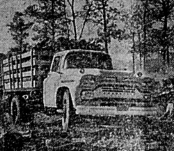
Series 60 stake shows its stuff on off-the-road jobs

You don't have to haul 30-ton loads out of a stone quarry before your job's considered tough. The rough ones come in every weight class. And right there is where a whole fleet of Taak-Force Chevies comes rolling in. As far back as they go, Chevrolet trucks have always been long on stamina and short on down-