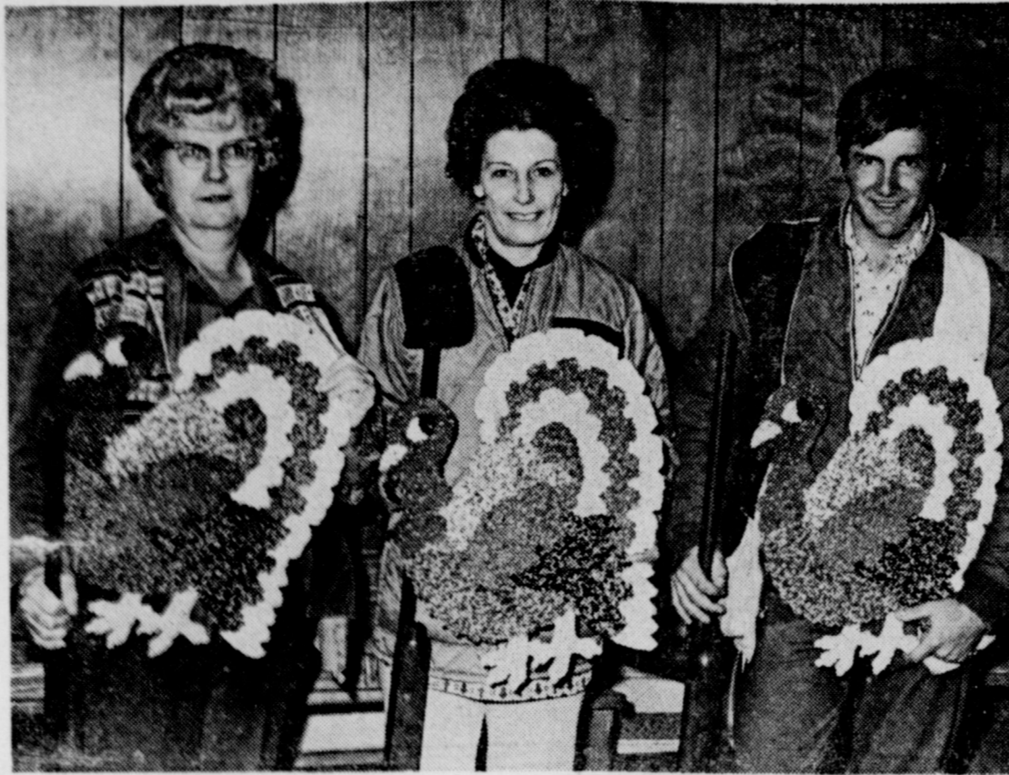
Among winners at the Big Six Gun club pre-Thanksgiving Turkey Shoot, Sunday, were Mrs.