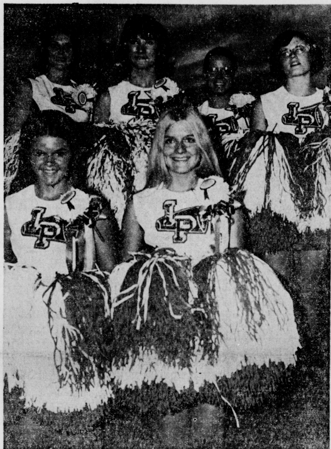
The band with its drum majors and twirlers, plus the green and white clad pep club are beautifully complemented at every Hawk football game by these six cheerleaders.

Some of the Beaconlights' needs: Understanding Publicity Jobs Transportation to meetings Funds for purchase of bumper stickers and badges, to aid in publicity and to raise funds Funds for the purchase of handicraft kits Assistance in the sale of light bulbs