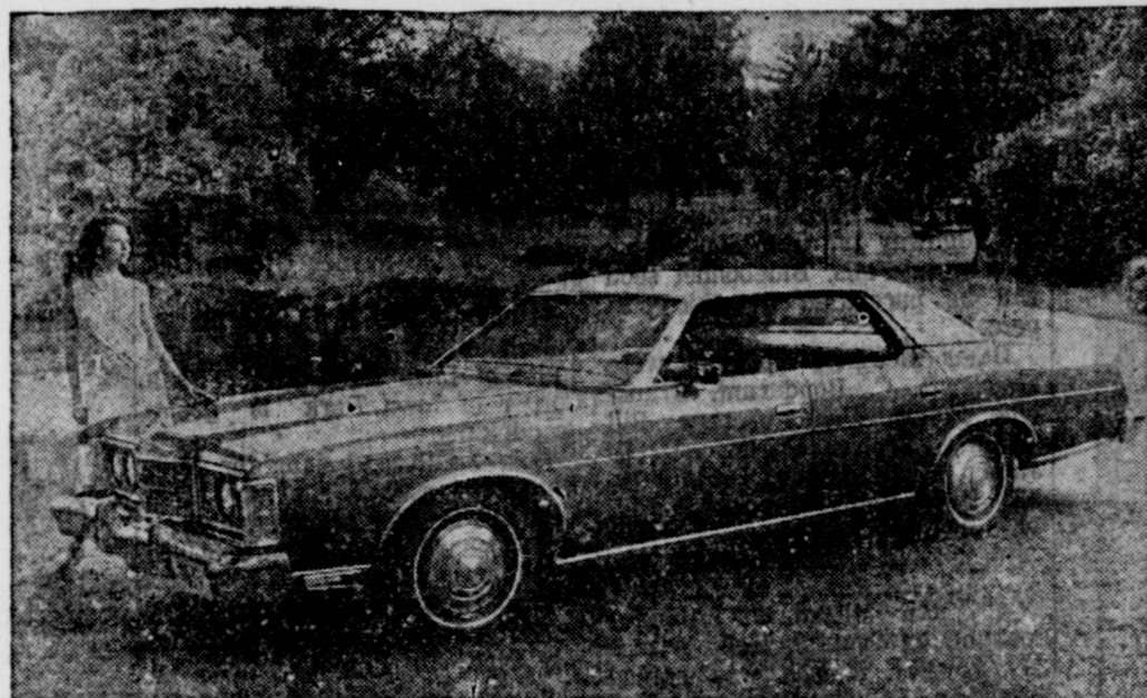
Most changed Ford Division car for 1973 is the full-sized Ford. Shown here is the LTD four-door hardtop. All-new sheet metal below the window line and a new segmented grille give the 1973 Ford a more formal look. All 1973 Fords have a new impact-absorbing bumper system, although the overall length of the car is increased only about one inch. Power front disc brakes, power steering, SelectShift Cruise-O-Matic transmission and a 351-2V eight-cylinder engine are standard in all new Fords.