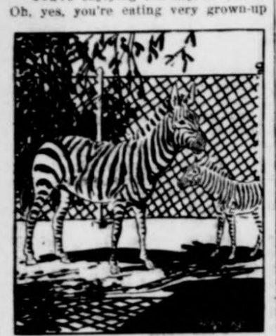
"A Little Bird Told Me," Said Mother

"Regal means kingly, of course. "You're enjoying the hay, too, now.